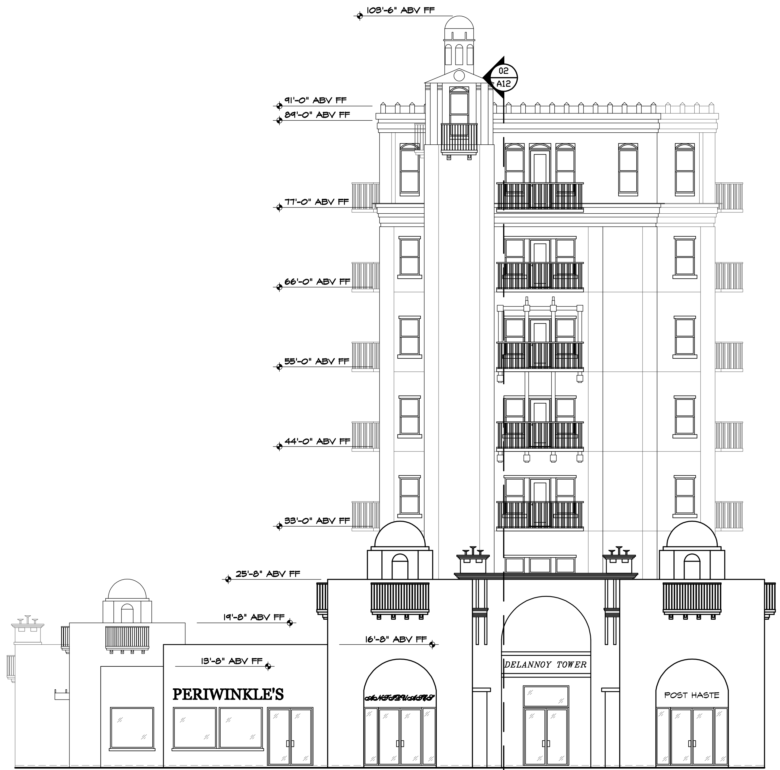
01 A6 NORTH ELEVATION 1/8"=1'-0"